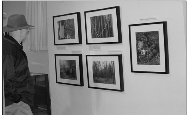
Photos are grouped by categories such as wildlife and how the trees are managed, from planting to harvest.