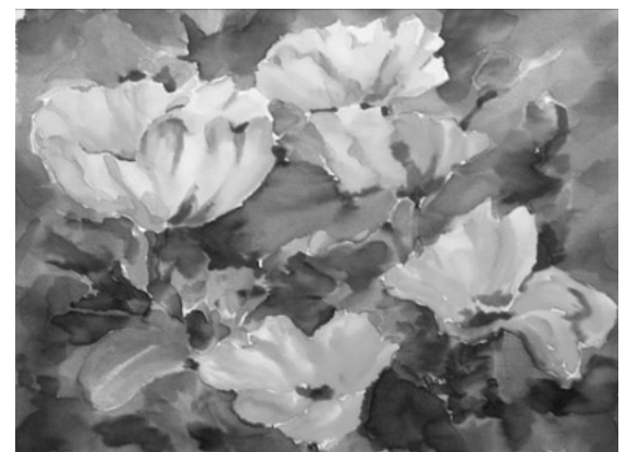
Flower Power of Poppies