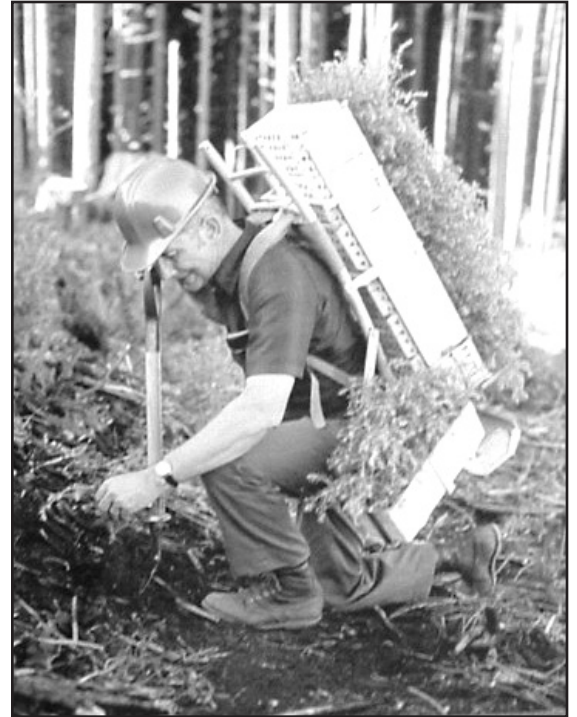
How trees were planted in 1970.