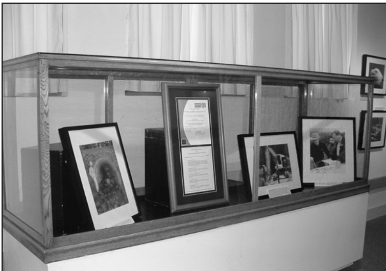
Exhibit cases are filled with memorabilia of Rayonier's past.