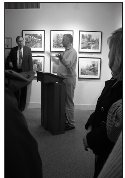
State Rep. Kevin Van de Wege touched on some legislative issues that face the timber industry.