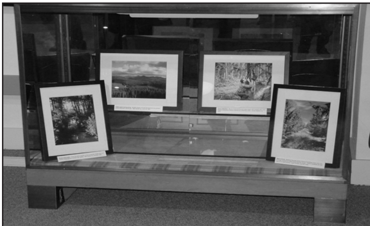
Eighty years are detailed in both black and white and color photos.