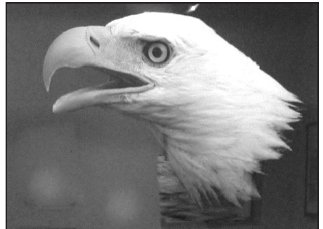
Wildlife habitat and preservation is a priority.