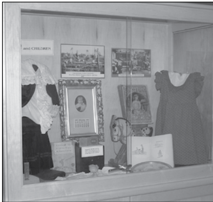
Childrens' clothing with lace and ruffles.