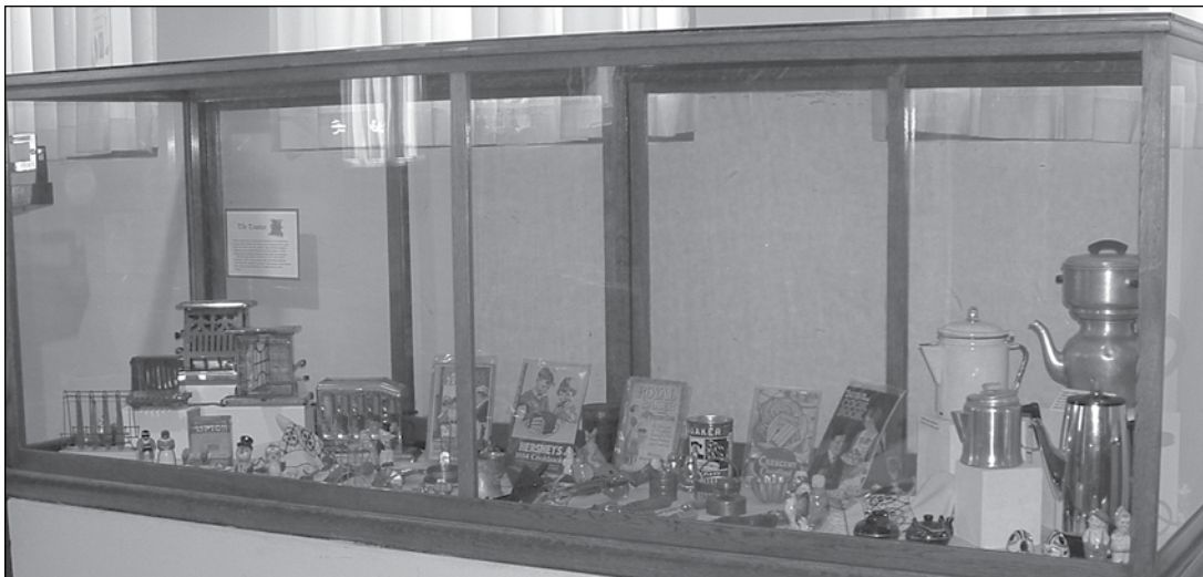
Several generations of toasters and a variety of coffeepots are on display along with the kitchen gadgets of the time.