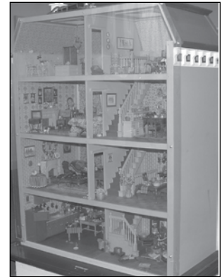
A doll house shows a home in miniature during the early 1900s.